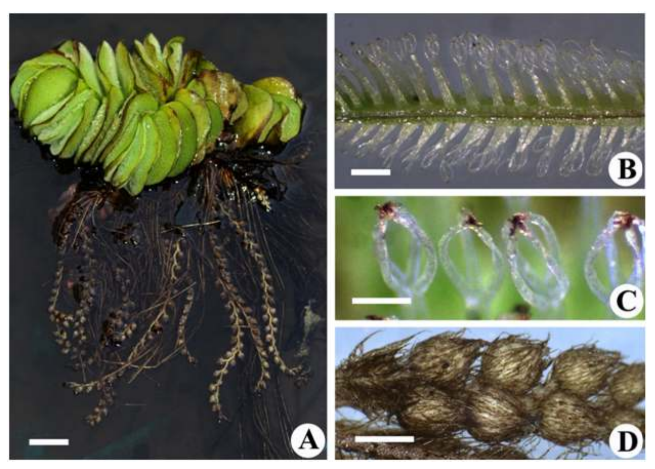
Figure 3 (A-D): A. Salvinia molesta habit showing sporocarp (arrowhead) B. Transverse view of S. molesta papillate leaflet C. Enlarged view of figure 3B showing papillae D. Enlarged view of S. molesta sporocarp. Scale bar: A = 10 mm B = 1 mm C = 0.5 mm D = 4 mm.

lamina. Spike short, 38-42 mm high and surpassing sterile lamina, apex acute; sporangia 8-16 pairs. Spore surface coarsely reticulate. Rhizomes erect, thick with numerous fibrous roots.